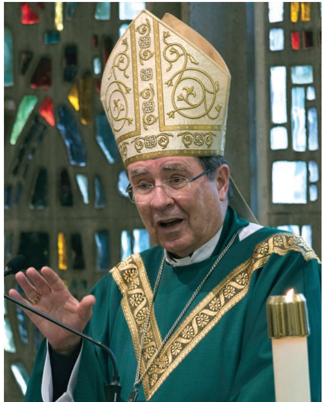
Apostolic Nuncio for the United States, Archbishop Christophe Pierre, giving a homily at the Mass he celebrated at TC on October 23, 2017.

How can future priests expect to succeed in a battle that appears futile? The answer for Archbishop Pierre resides in our own personal encounters with Christ through the Church. For many of us, such encounters have helped us to experience more intimately the realness of Christ and his love. And as we grow in our priestly vocation, this gift of grace will be the driving force in our mission of bringing Christ into the lives of