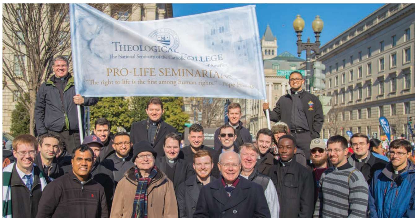
Theological College seminarians with TC and Catholic University faculty at the March for Life on January 19, 2018.

As always, the crowd was huge. Colored scarves, identifying various groups, were to be found everywhere and every once in a while you would see a group you recognized or a friend you never expected to see there. Waiting for the March, we took a spot next to the Dominican Friars (as is only appropriate since they are our next-door neighbors!). Around 1:30 p.m., the crowd began to move and the March began.