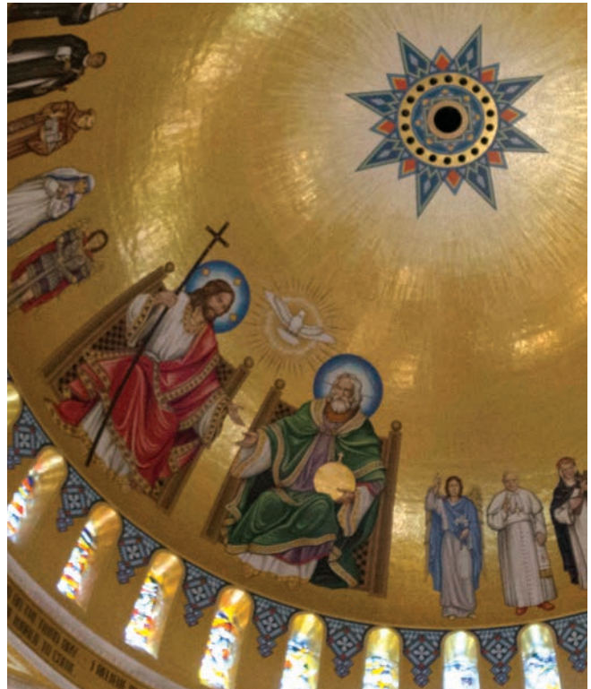
The Trinity Dome after its unveiling on the Feast of the Immaculate Conception in December.

The experience of seeing the Trinity Dome come to completion was a blessing in many ways, and there is one reality that stands out to me above them all. Any mosaic, let alone one as large as the Trinity Dome, requires such artful skill. The artists work with many sheets of glass of varying colors. They take the time to cut each piece in such a way that every piece is unique. The artists then place the many unique pieces of glass — different in size, shape, and color — in a specific way so that they create one marvelous image. This struck me deeply as a beautiful paradigm for the reality of the Church. Saint Paul, in his first letter to the Corinthians, says, "As a body is one though it has many parts, and all the parts of the body, though many, are one body, so also Christ"