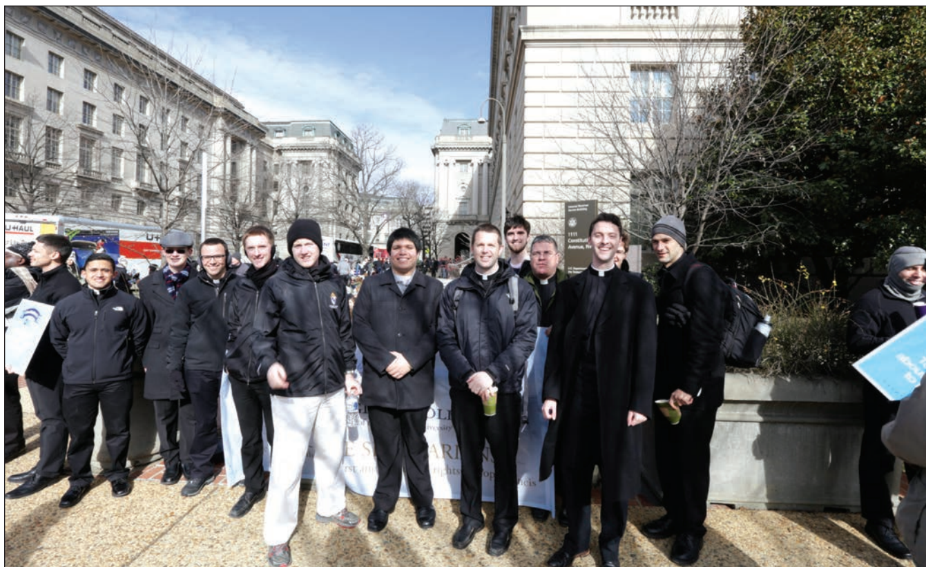
TC seminarians on Constitution Avenue at the March for Life.

Syracuse seminarians and found it very moving to be there with so many people from home. As our bishop delivered his homily to the congregation, I looked around the church and was struck with a sense of humility at the group gathered there. Even though the chapel was packed to overflowing and many people were forced to stand for the duration of the Mass, the congregation felt small, like a tight-knit community. The notion of “pilgrim” once again came to my mind and I reflected on the novelty that this small representation of the Syracuse diocese had traveled so far, compelled by their faith in Jesus Christ and their belief in the sanctity of every human life.