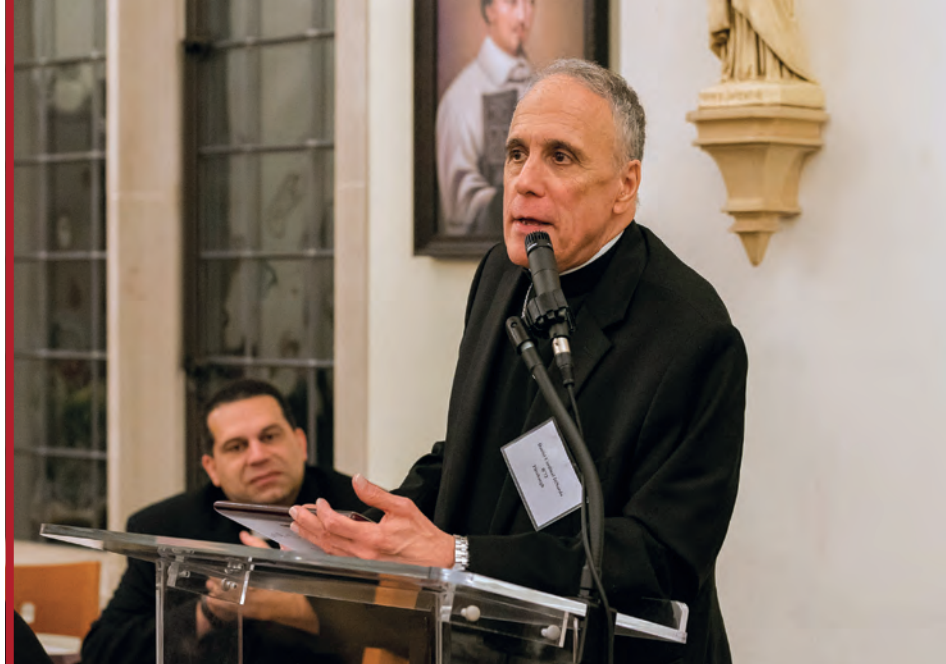
Daniel Cardinal DiNardo (B '72) accepted TC's Alumnus Lifetime Service Award at the 2021 Alumni Day Award Dinner.